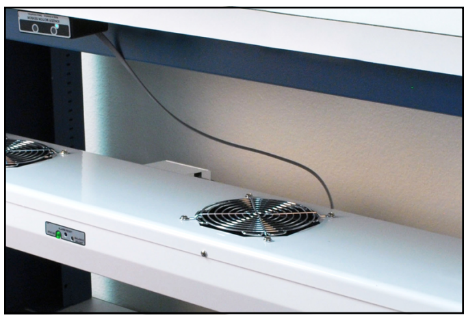
Figure 5. Using the Ionizer Motion Sensor with the 60473 Chargebuster® 3-Fan Overhead Ionizer