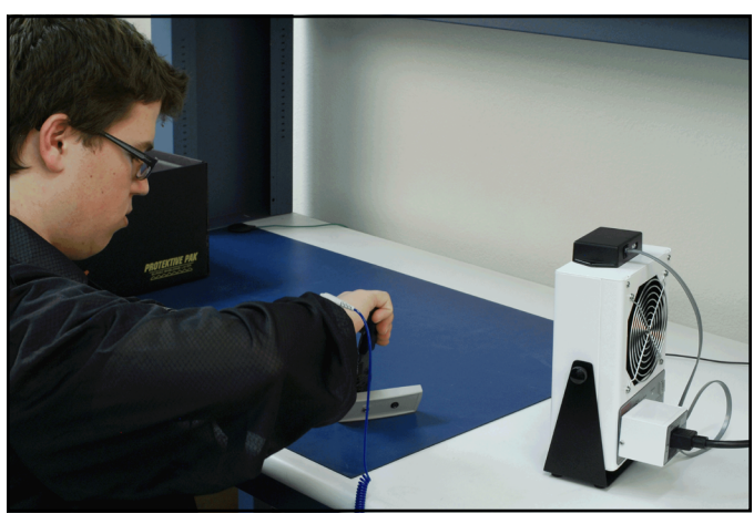
Figure 4. Using the Ionizer Motion Sensor with the 60505 High Output Benchtop Ionizer

Leave the sensor's field of view to activate the shutoff delay timer. The Ionizer Motion Sensor's LED will turn off and unpower the ionizer once the preset deactivation delay time is reached.