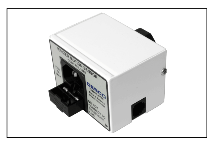
Figure 6. Replacing the fuse in the Control Unit

The fuse located in the Control Unit may be replaced by removing the power cord and opening the fuse drawer at the IEC inlet. The Control Unit uses one 5A, 250V slow blow fuse. DO NOT use other ratings as it may pose a safety hazard.