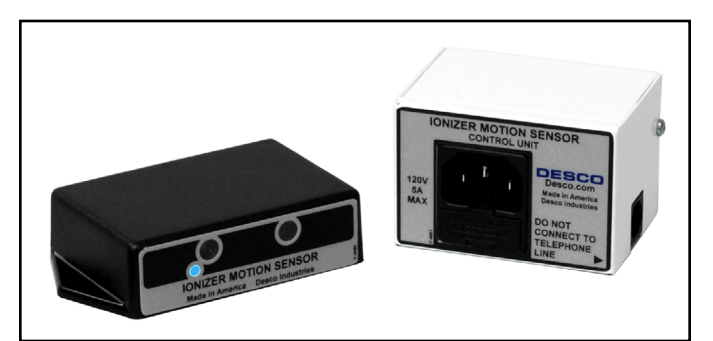
Figure 1. Desco 60509 Ionizer Motion Sensor