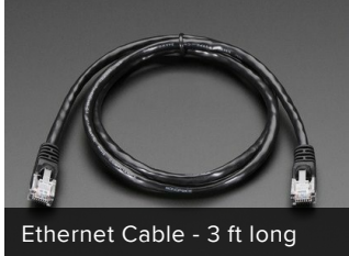
Ethernet Cable - 3 ft long