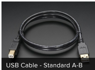
USB Cable - Standard A-B