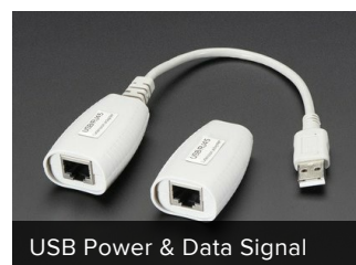
USB Power & Data Signal