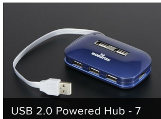
USB 2.0 Powered Hub - 7