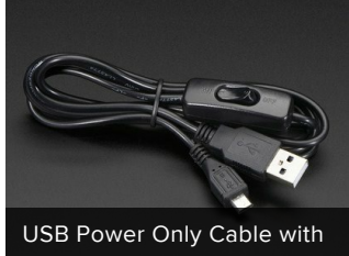
USB Power Only Cable with