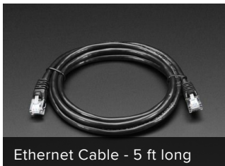
Ethernet Cable - 5 ft long