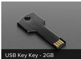
USB Key Key - 2GB