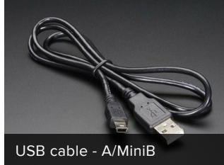
USB cable - A/MiniB