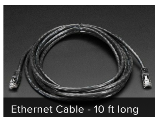
Ethernet Cable - 10 ft long