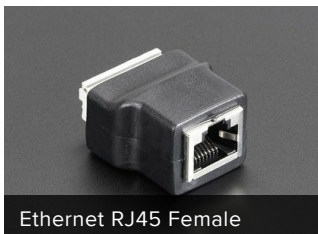
Ethernet RJ45 Female