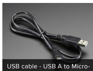
USB cable - USB A to Micro-