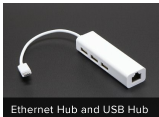
Ethernet Hub and USB Hub