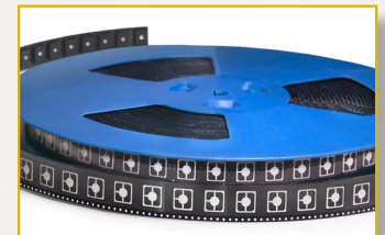
Frame shown in tape & reel packaging