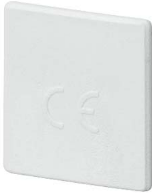
End cap 2 and 3-phase for pin busbars according to UL 508