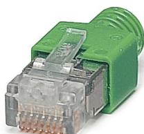
RJ45 connector, design: RJ45, degree of protection: IP20, number of positions: 8, 1 Gbps, CAT5 (IEC 11801:2002), material: Plastic, connection method: Crimp connection, connection cross section: AWG 26- 24, cable outlet: straight, color: gray, Ethernet

https://www.phoenixcontact.com/us/products/2744856