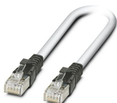
Patch cable, CAT5, assembled, 1.5 m

https://www.phoenixcontact.com/us/products/2832221