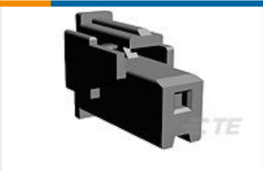
TE Part #4-1123823-1 EP 1P PLUG RED