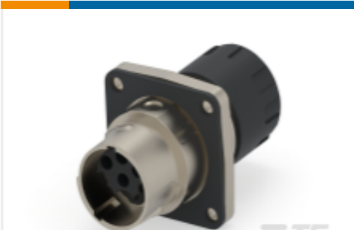
TE Part #EKB201N00330602000 915 EXTENSION