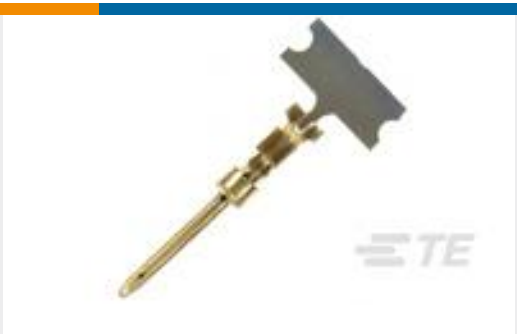
TE Part #1658539-5 PIN CONT DUPL PLT STRIP HD-20