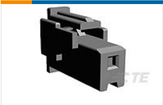
TE Part #3-1123823-1 EP IP PLUG BLUE