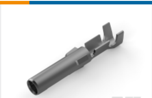
TE Part #2029185-1 CMNL SKT W/INDENTED SIDES