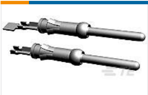
TE Part #66425-7 III+ PIN,30-26,15AU/FL,STRIP