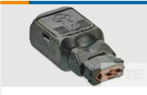
TE Part #D369-R33-BS1 369 3 WAY REC, CRIMP, SKT