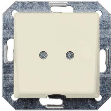
DELTA i-system electrical white outlet plate, 55x 55 mm