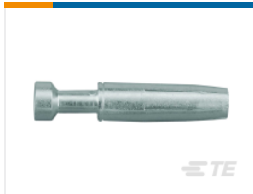
TE Part #T2030002002-000 CEF-0.3