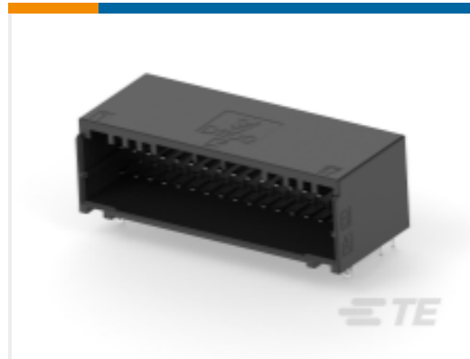
TE Part #1-2372488-7 D1100 HDR ASSY H 34P XBLACK PRE-TIN