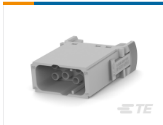
TE Part #T2111082101-000 HMN-008-M