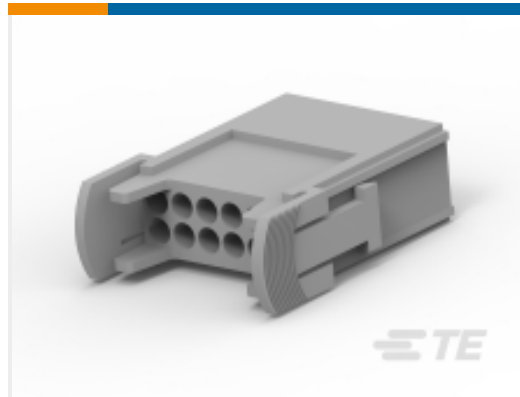
TE Part #T2111122101-000 HMN-012-M