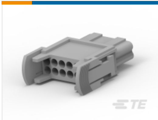
TE Part #T2111122201-000 HMN-012-F