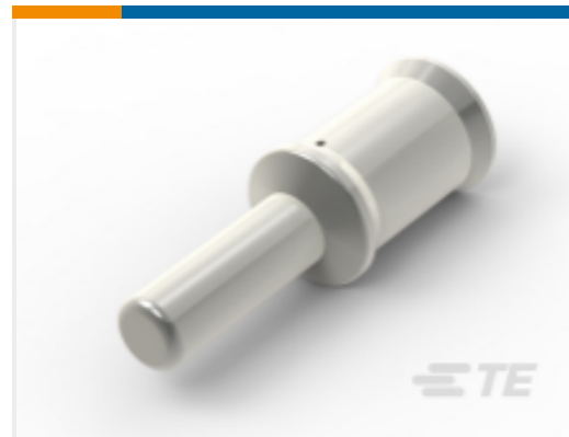
TE Part #T2400001160-000 CSM-16