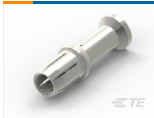
TE Part #T2050002025-000 CNF-25