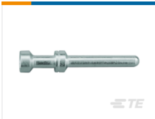
TE Part #T2030001002-000 CEM-0.3