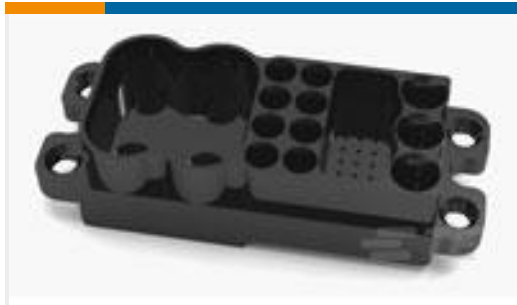
TE Part #1648552-1 295-0049-01100