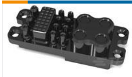
TE Part #1648578-1 296-0049-01100