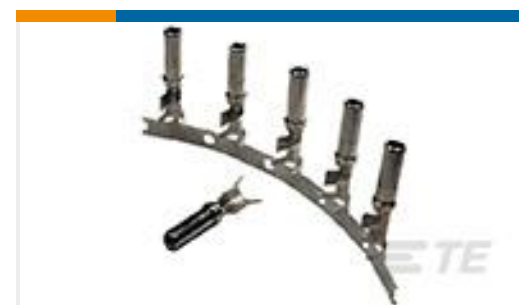
TE Part #1062-12-0166 SOC, SF, SIZE 12, 12-14, NI/SN