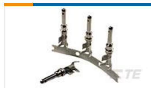
TE Part #1060-12-0166 PIN, SF, SIZE 12, 12-14, NI/SN