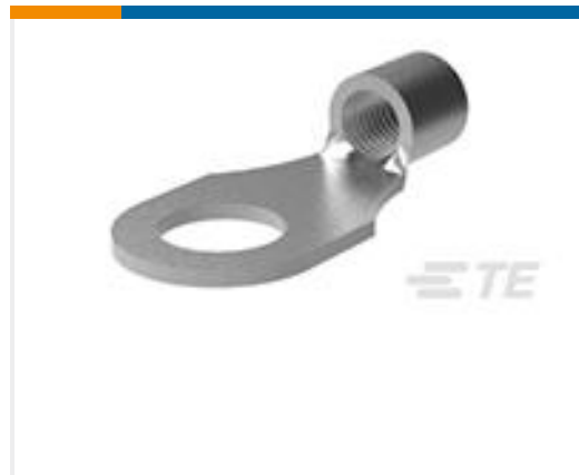
TE Part #36932 BODY SOLIS RING 4/0 3/8