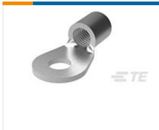
TE Part #35184 TERMINAL,SOLIS R 2 3/8