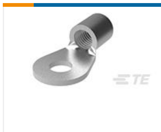
TE Part #2-33465-1 TERMINAL,SOLIS R 6 1/4