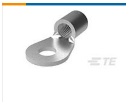
TE Part #36919 TERMINAL SOLIS RING 1/0 1/2