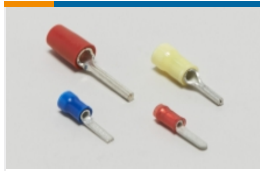
Crimp Wire Pins, Tabs & Ferrules(19)