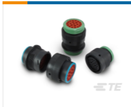
TE Part #HDP24-24-14PN DEUTSCH HDP20 Housings