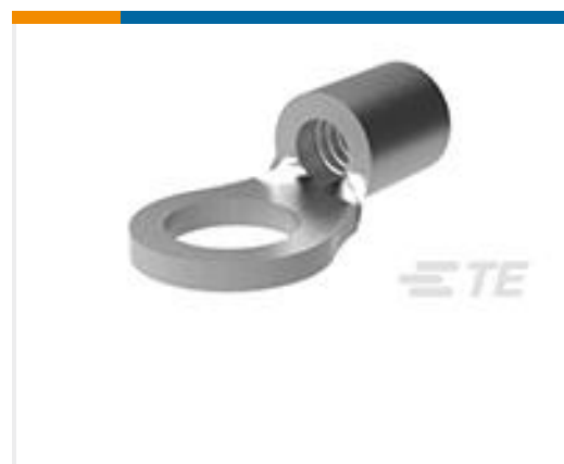
TE Part #34123 TERMINAL,SOLIS R 16-14 10