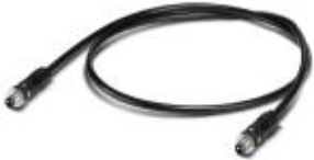
GOF MM cable, assembled with M12 OPTIC to M12 OPTIC

Assembled FO cable, round cable, 50/125 µm GOF-MM fiber, M12 to M12, for installation inside buildings