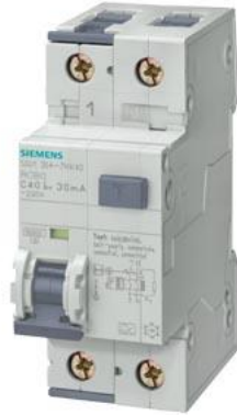
RCBO, 10 kA, 1P+N, type A, 30 mA, C-Char, In: 6 A, Un AC: 230 V