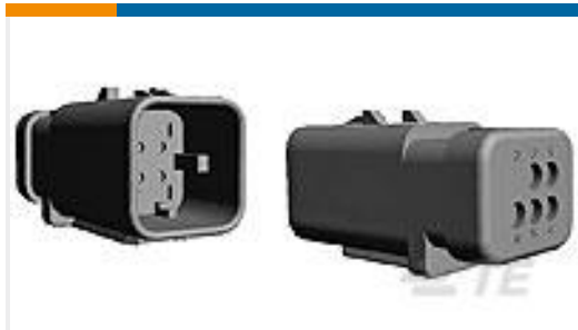
TE Part #776434-3 AS16,CAP ASSY,ST,06P,N SEAL,CODE C