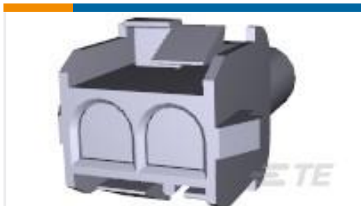
TE Part #1-480699-1 02P UMNL CAP HSG BRN