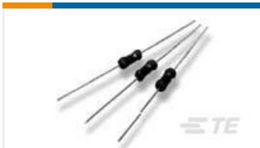
TE Part #8-1879352-7 RR02 5% 1K2 AMMO