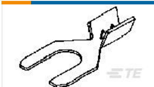
TE Part #60234-2 SPADE 26-22 AWG TPBR