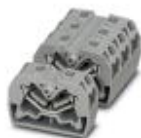
The figure shows a version of the article

Mini feed-through terminal block, Connection method: Spring-cage connection, Number of connections: 4, Cross section: 0.08 mm 2 - 4 mm 2 , AWG: 28 - 12, Width: 10.4 mm, Height: 22 mm, Color: yellow, Mounting type: Direct mounting with flange