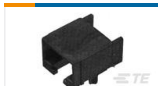
TE Part #406732-2 MJ,10MM,8P,SHLD,NO HSG POST,SN