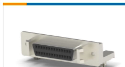
TE Part #5787394-7 D-Sub Receptacle Assembly: Right Angle, 1.27mm