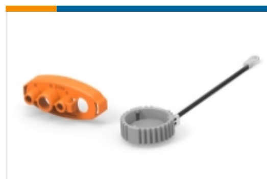
Connector Caps &amp; Covers(21)