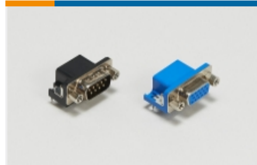
PCB D-Sub Connectors(172)