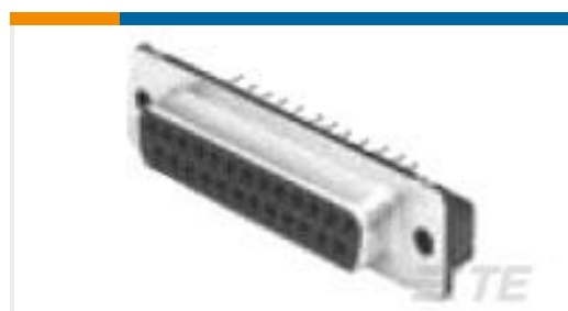
TE Part #747299-2 15 RCPT SP/FMS STD