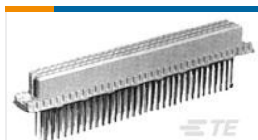
TE Part #1-148059-5 09% EURO TYP C RECP 17MM ASSY