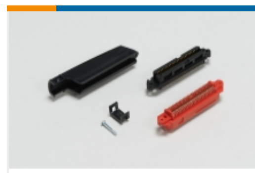
IDC D-Sub Connectors(64)