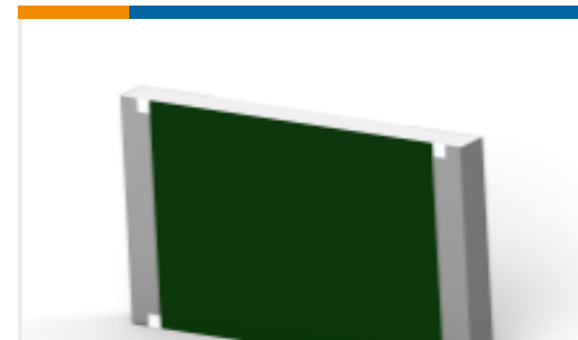
TE Part #8-2176407-8 3560 27R 5%