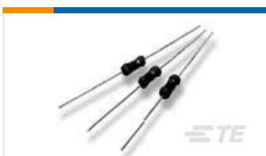
TE Part #4-1879350-2 RR01 5% 11R AMMO