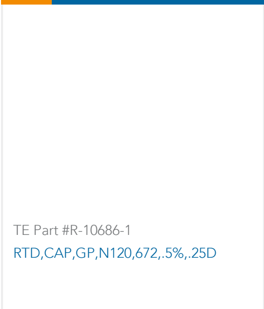
TE Part #R-10686-1 RTD,CAP,GP,N120,672,.5%,.25D