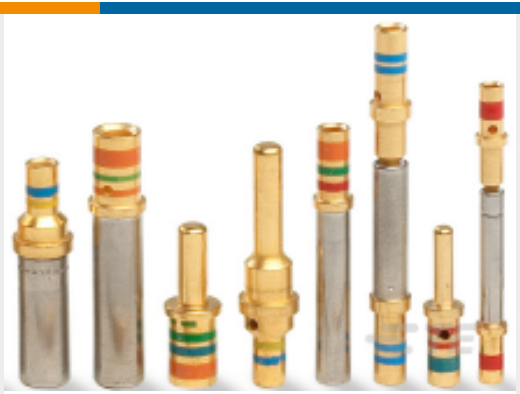
TE Part #4162-201-1631L CONT SOC ASSY