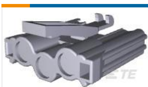
TE Part #770855-1 03P FAN MOTOR CONN HSG