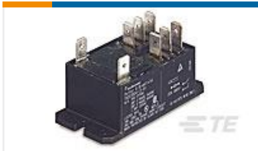
TE Part #1-1423008-0 T92P7D52-12