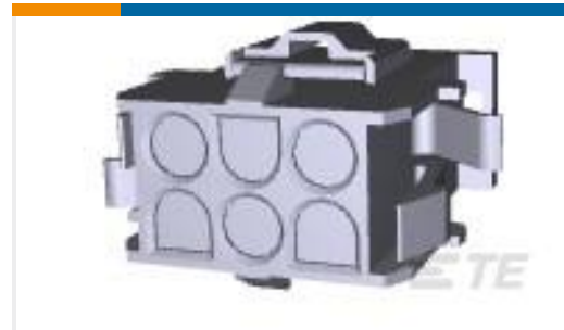
TE Part #770027-1 06P UMNLII IN-LINE CAP HSG KIT