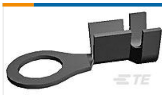
TE Part #60771-2 RING CRIMP 18-14 AWG TPBR