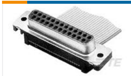
TE Part #1658610-3 15 POS HDF RCPT, MS, LEAD FREE