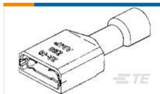
TE Part #2-520979-2 ULTRAFast .110/.125 ASY REC 22-18 TPBR