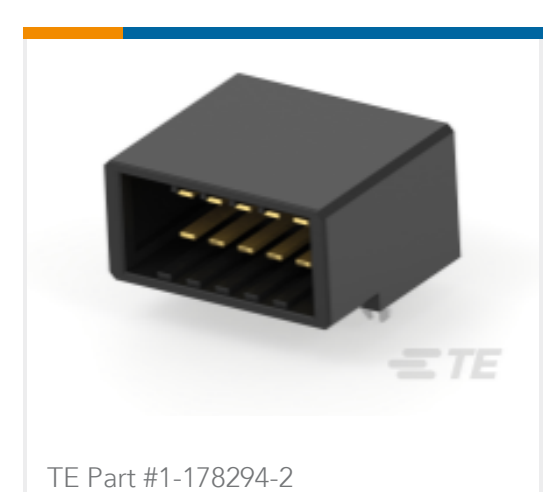
Header Assembly: Wire-to-Board, 15A, gold or tin plated