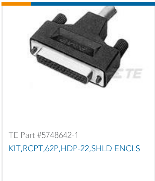
TE Part #5748642-1 KIT, RCPT, 62P, HDP-22, SHLD ENCLS