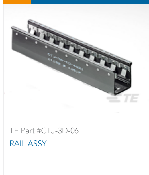
TE Part #CTJ-3D-06 RAIL ASSY