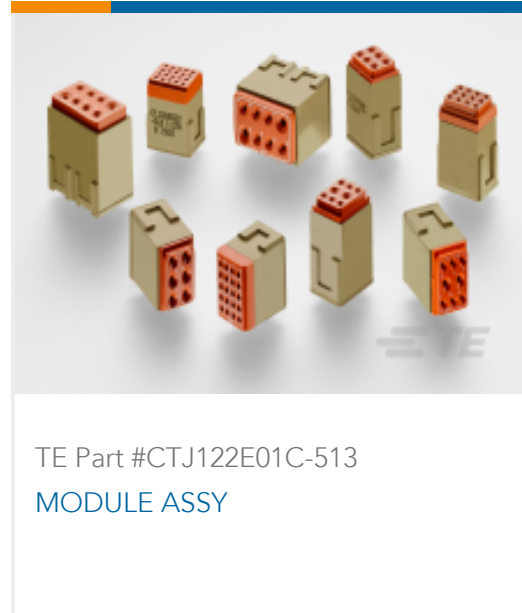
TE Part #CTJ122E01C-513 MODULE ASSY