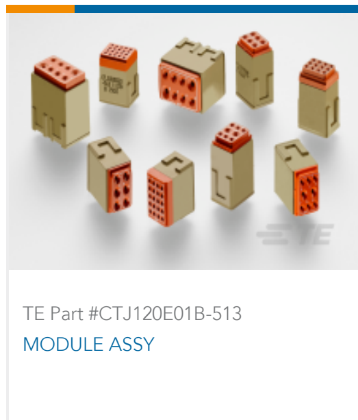
TE Part #CTJ120E01B-513 MODULE ASSY