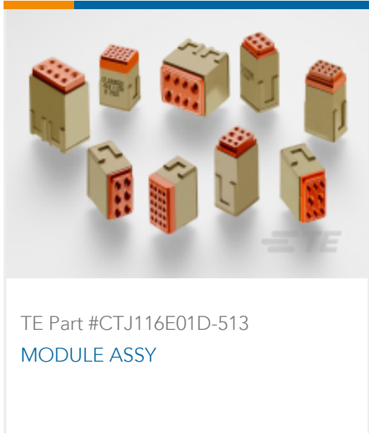
TE Part #CTJ116E01D-513 MODULE ASSY