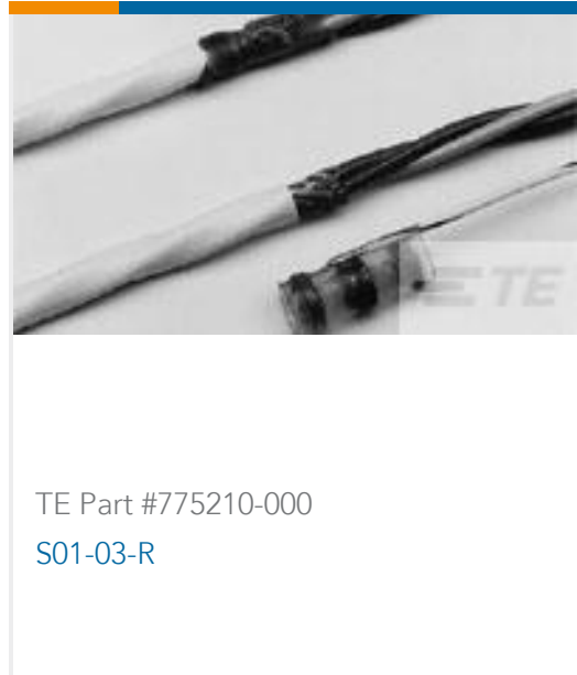
TE Part #775210-000 S01-03-R