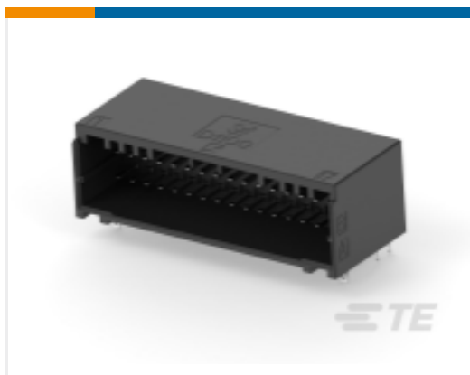
TE Part #1-2372488-7 D1100 HDR ASSY H 34P XBLACK PRE-TIN