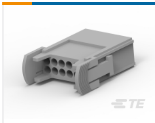
TE Part #T2111122101-000 HMN-012-M