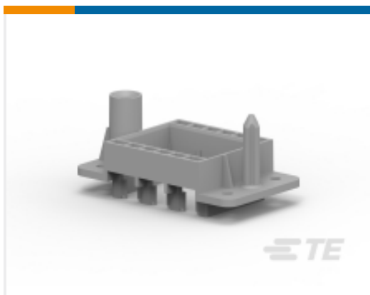
TE Part #T2071104201-000 H10BP-T3-F DOCKING FRAME_FIXED