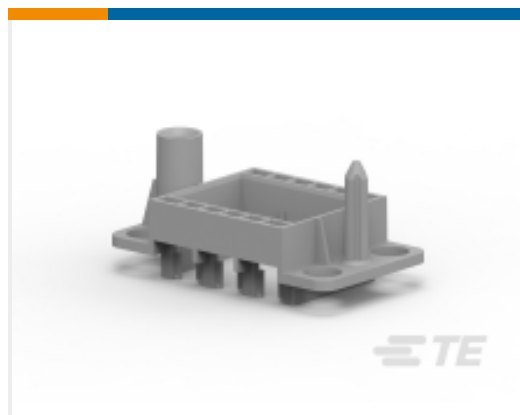
TE Part #T2071104101-000 H10BP-T3-M DOCKING FRAME_FLOATING