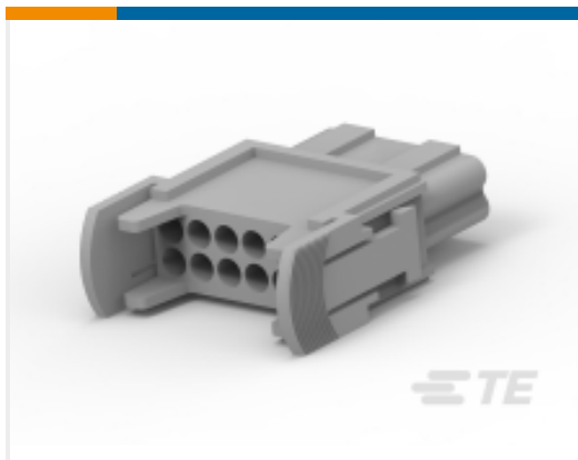
TE Part #T2111122201-000 HMN-012-F