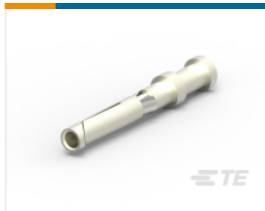
TE Part #T2020002002-000 CDF-0.3