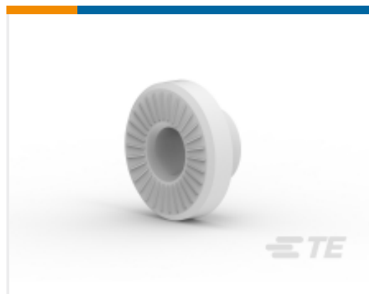
TE Part #T0930050457-000 FLOATING WASHER