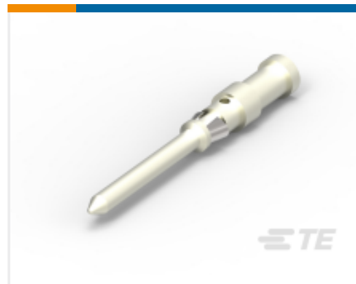
TE Part #T2020001002-000 CDM-0.3