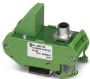
VARIOFACE module, with spring-cage connection terminal blocks and M12-SAC socket, 8-pos.

Please be informed that the data shown in this PDF Document is generated from our Online Catalog. Please find the complete data in the user's documentation. Our General Terms of Use for Downloads are valid ( http://phoenixcontact.com/download )