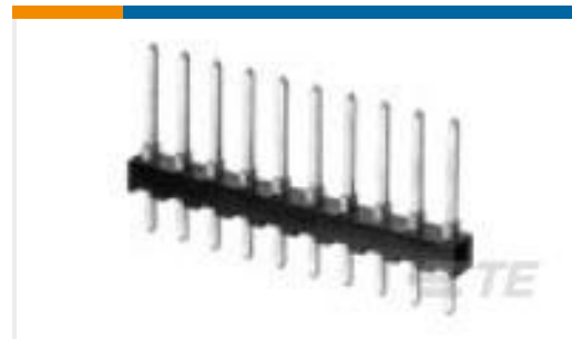
TE Part #87527-3 03 MODII HDR SRST UNSHRD .100