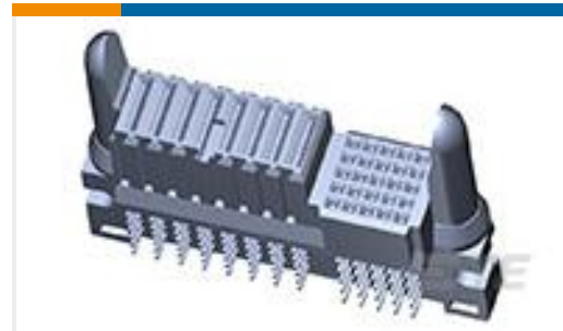
TE Part #2-1926739-5 AssyMinipak Hdl25s10pRARecptSc