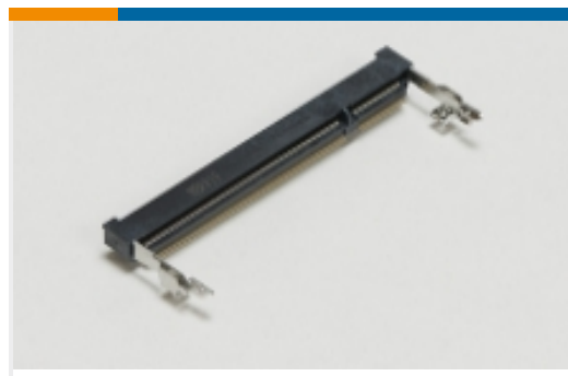
SO DIMM Sockets(39)