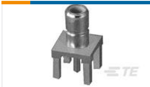
TE Part #413990-2 STR JACK,SMB,PCB