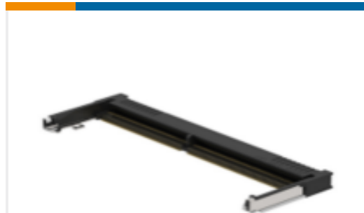
TE Part #2309409-1 DDR4 SO DIMM Sockets