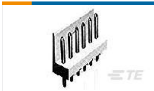
TE Part #171825-3 POST HEADER ASSY EI SRS 3POS