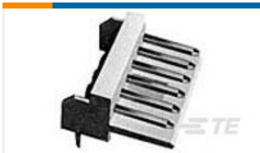
TE Part #171826-3 3P POST HEADER ASSY EI