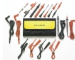
Leads, Probes and Clips Compatibility Chart