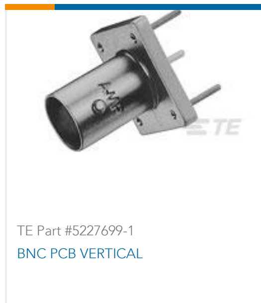
TE Part #5227699-1 BNC PCB VERTICAL