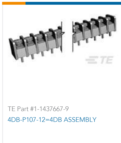
TE Part #1-1437667-9 4DB-P107-12=4DB ASSEMBLY