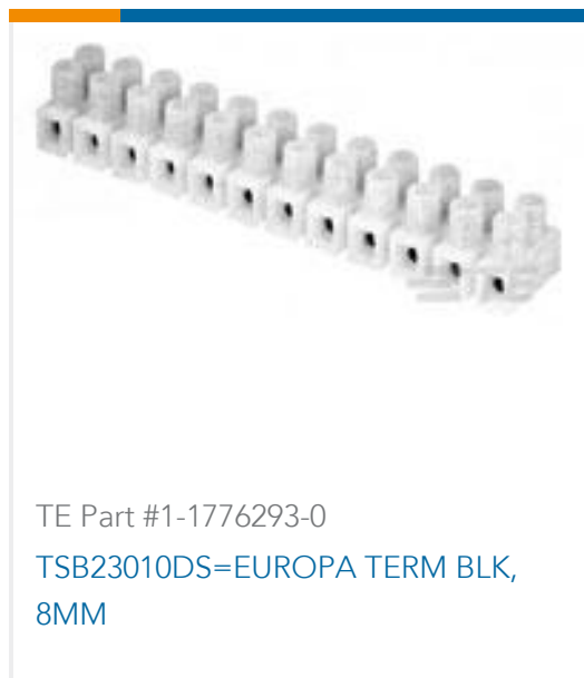
TE Part #1-1776293-0 TSB23010DS=EUROPA TERM BLK, 8MM