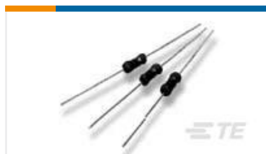
TE Part #4-1879350-2 RR01 5% 11R AMMO