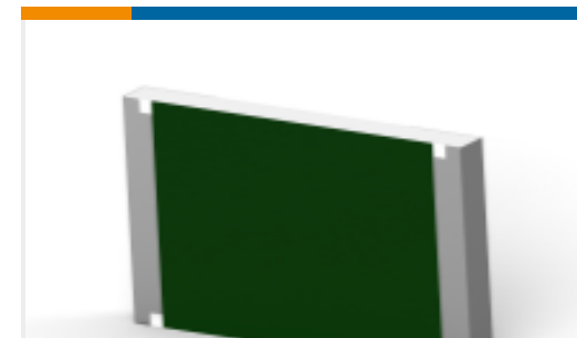
TE Part #8-2176407-8 3560 27R 5%