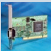
UC-324 uPCI 1xRS422/485 1MBaud