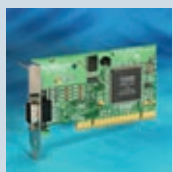
UC-320: LP uPCI 1xRS422/485 1MBaud