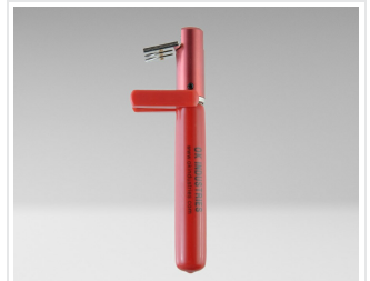
ST-100-2830 - Cut-Strip Tool 28-30 AWG