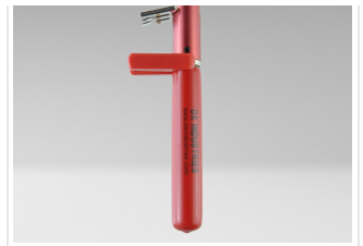
ST-100-2426 - Cut-Strip Tool 24-26 AWG