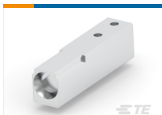
TE Part #5120913-9 UPM KEYED GUIDE MODULE, M3