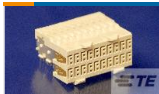
TE Part #6469028-1 HM-ZD 2PR RECP 40P