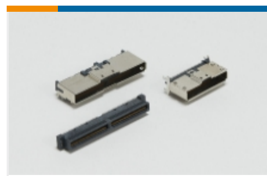
Internal I/O Connectors(133)