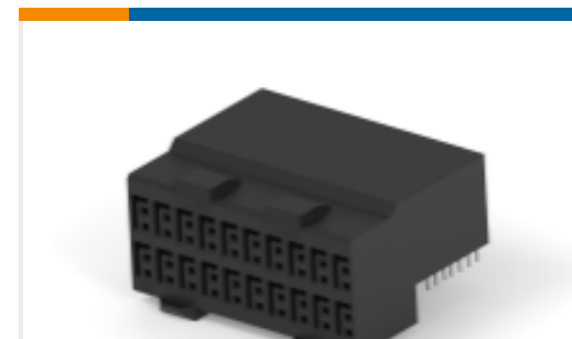
TE Part #2329397-1 RECEPTACLE HM-EZD+, 2PAIRS 10COLUMNS