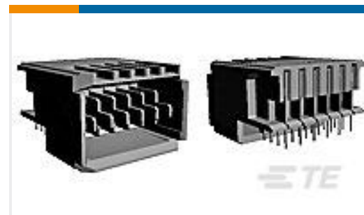
TE Part #5223968-1 TE UPM R/A Header 3P STD Power, LMM