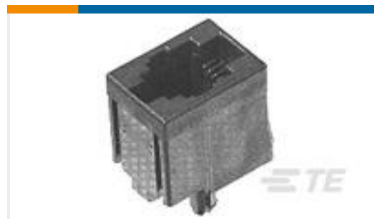
TE Part #5520259-4 MJ,TE,8P,TRAYS