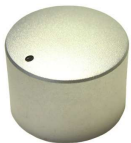
FC72325 KMR25 SILVER