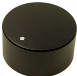
FC7233 KMR30 BLACK