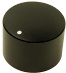
FC7232 KMR25 BLACK