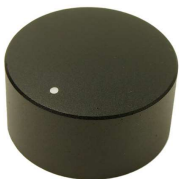
FC7234 KMR35 BLACK