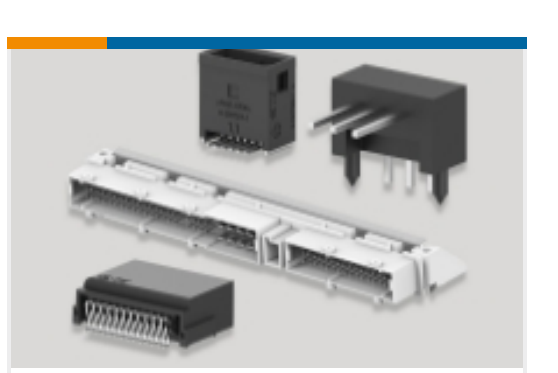
PCB Headers & Receptacles(134)