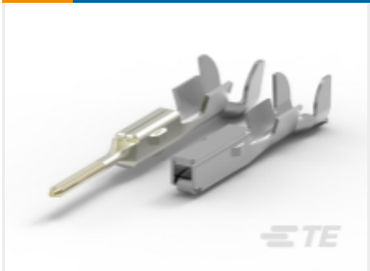
TE Part #368087-1 MULTILOCK, RECEPTACLE AND TAB