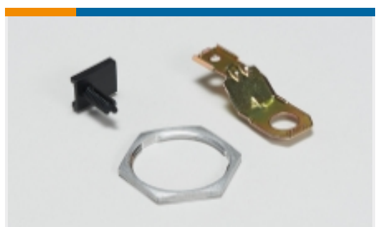
Other Automotive Connector Accessories(12)