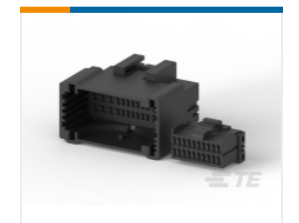
TE Part #936211-1 MULTILOCK, CONNECTOR HOUSING