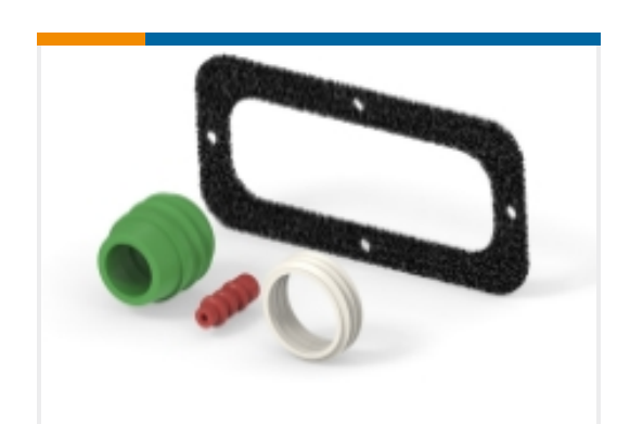
Connector Seals & Cavity Plugs(2)