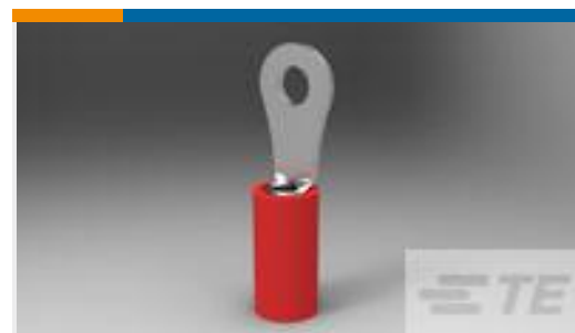
TE Part #2-323758-1 PIDG R 22-16 COMM 22-18 MIL 4