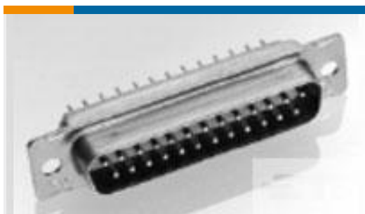
TE Part #205559-2 RECEPT ASSY,25 POSN,AMPLIMITE