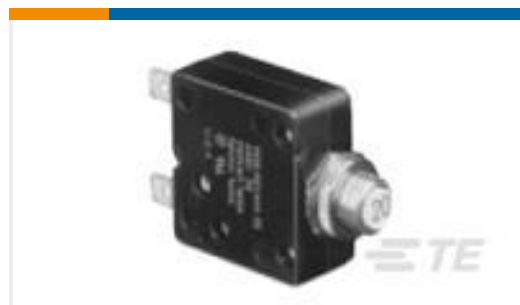
TE Part #4-1393249-3 W58-XC4C12A-20=W58