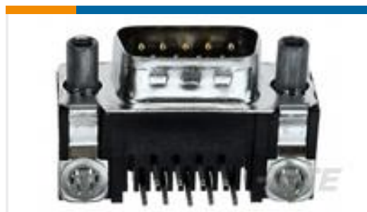
TE Part #5747842-5 25 MSFL PLUG RA 318 (SL,FM,BL)