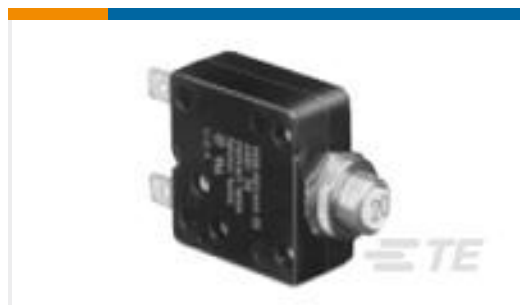
TE Part #4-1393249-2 W58-XC4C12A-2=W58