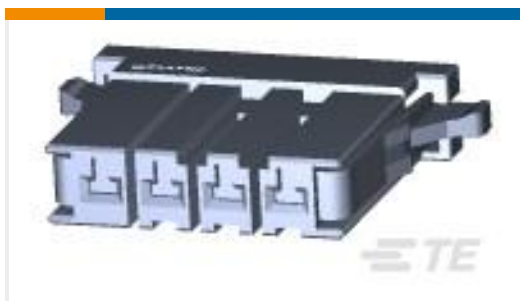
TE Part #2-178128-4 DYNAMIC 3200 REC HSG 4P SGL Y