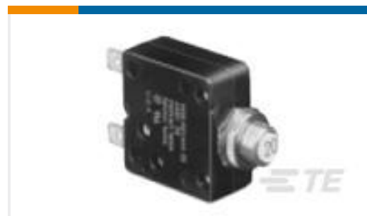
TE Part #4-1393249-6 W58-XC4C12A-30=W58