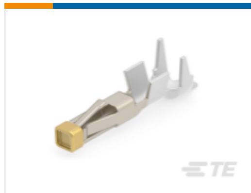
TE Part # 1-2834067-3 SOCKET CONTACT, MINIATURE WATERPROOF CONN