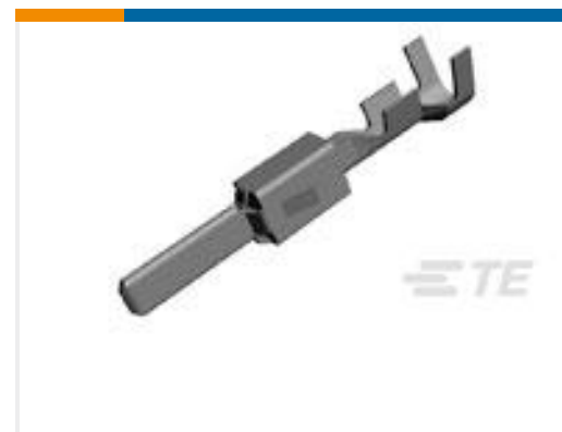
TE Part #2-962915-1 TAB 2.8x0.8 CONTACT CF SWS Sn