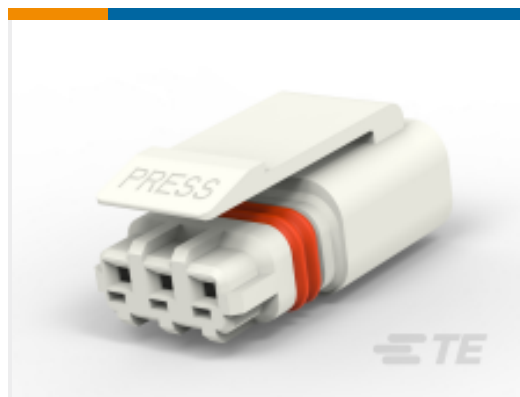
TE Part #1-2834074-3 3P PLUG, MINIATURE WATERPROOF CONN, WHITE