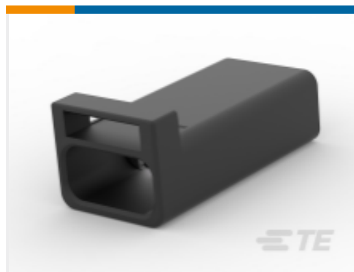
TE Part #1-2834075-2 SlimSeal Miniature Receptacles