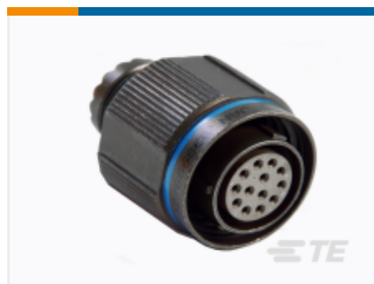
TE Part #YDTS26F09-35SNV001 PLUG ASSY