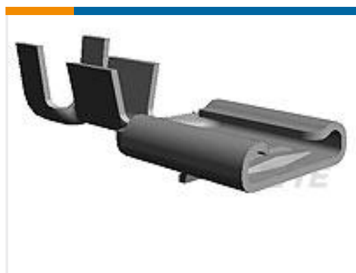
TE Part #62572-1 FF 110 REC 20-16AWG BR