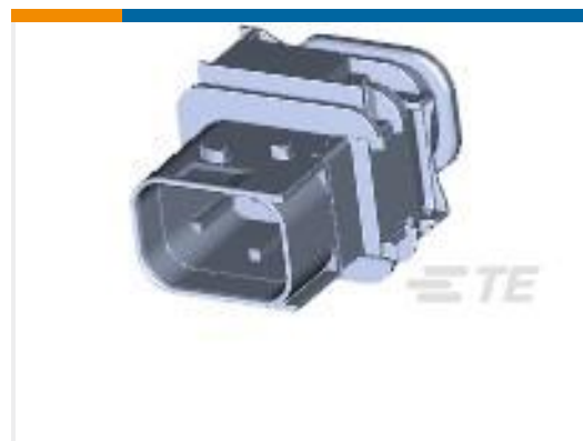
TE Part #1-1703648-1 7POS, MIXED, TAB HSG, ASSY, CODA