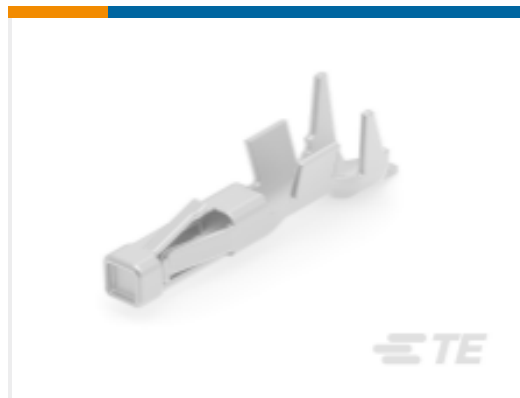
TE Part # 1-2834067-2 SOCKET CONTACT, MINIATURE WATERPROOF CONN