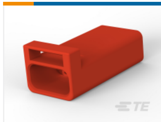
TE Part # 3-2834075-3 3P REC, MINIATURE WATERPROOF CONN.RED