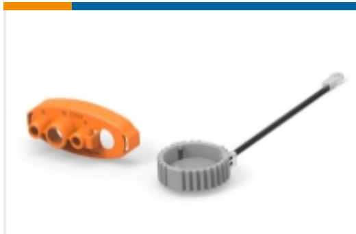
Connector Caps & Covers(4)