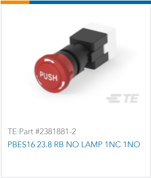
TE Part #2381881-2 PBES16 23.8 RB NO LAMP 1NC 1NO