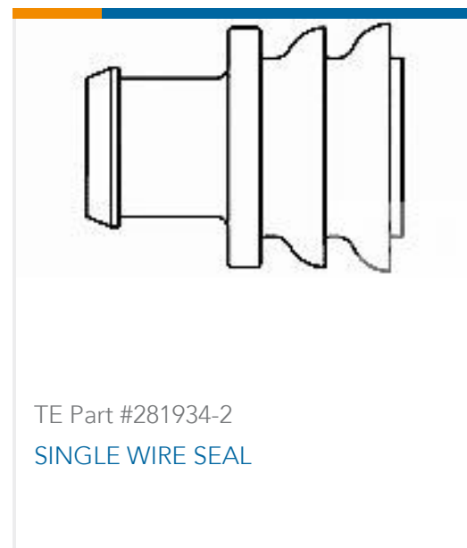
TE Part #281934-2 SINGLE WIRE SEAL