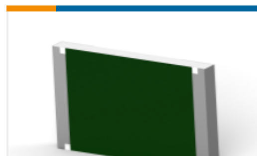
TE Part #8-2176407-8 3560 27R 5%