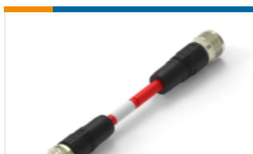
TE Part #TAA545B1411-060 M12A4-MS-FS-PVC-6.0M