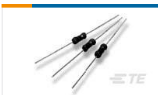
TE Part #4-1879350-2 RR01 5% 11R AMMO