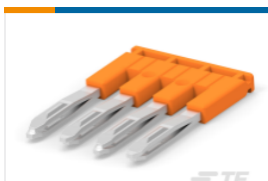
TE Part #1SNK906304R0000 JB6-4