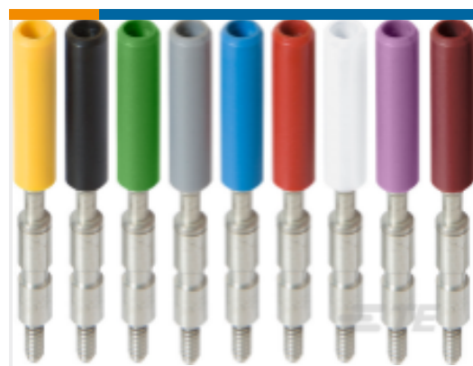
TE Part #1SNA179726R0200 AJS9