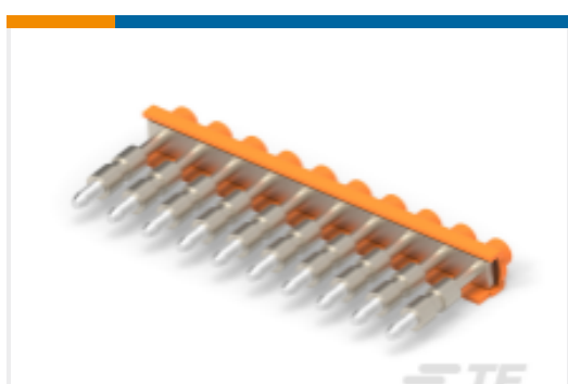
TE Part #1SNK908910R0000 JB8-10-R1