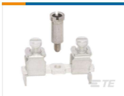
TE Part #1SNA206722R0200 AL4-M3-R1