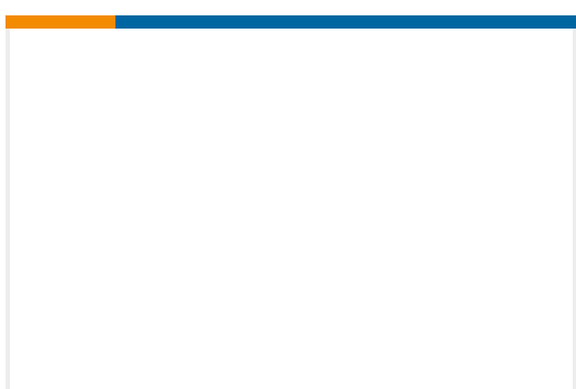
TE Part #1SNA164583R1500 BJS8