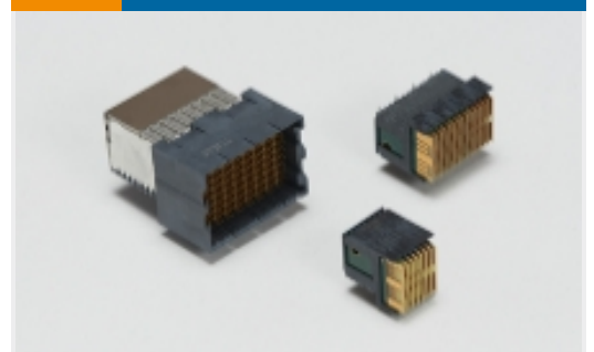
High Speed Backplane Connectors(1)