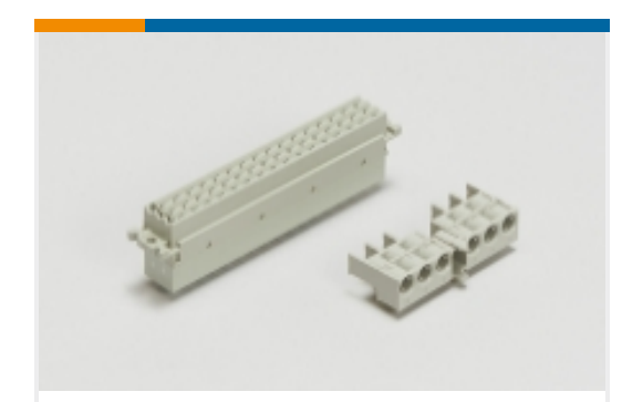
Backplane Connector Housings(4)