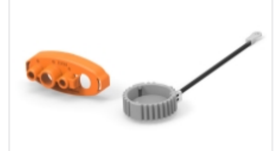
Connector Caps & Covers(62)