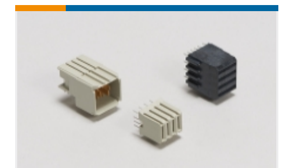
Backplane Power Connectors(6)