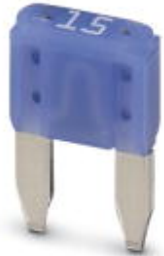
Fuse, nominal current: 15 A, length: 11.9 mm, width: 3.8 mm, height: 16.2 mm

Please be informed that the data shown in this PDF Document is generated from our Online Catalog. Please find the complete data in the user's documentation. Our General Terms of Use for Downloads are valid ( http://phoenixcontact.com/download )