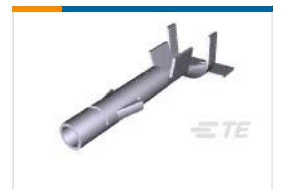
TE Part #926901-1 UMNL Socket 16-13 AWG