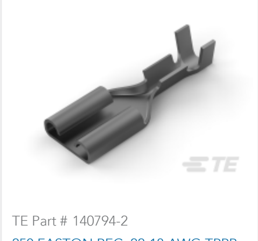
250 FASTON, REC., 22-18 AWG, TPPB