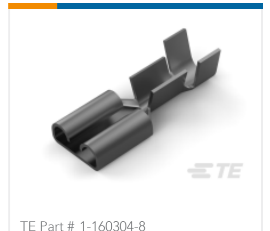
250 FASTON, REC., 14-17AWG, TPPHBZ