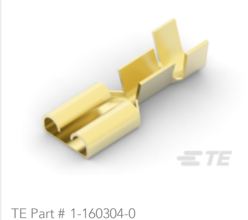
250 FASTON, REC., 14-17AWG, BR