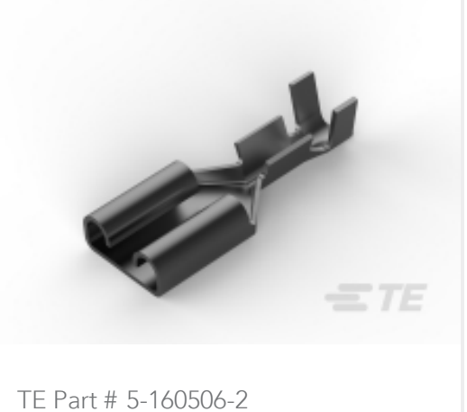
250 FASTON REC 20-16 AWG TPBR