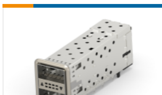
TE Part #2302407-1 QSFP+ ASSY, 2X1, GSKT, 2LP-OUTR, W/ CS GA