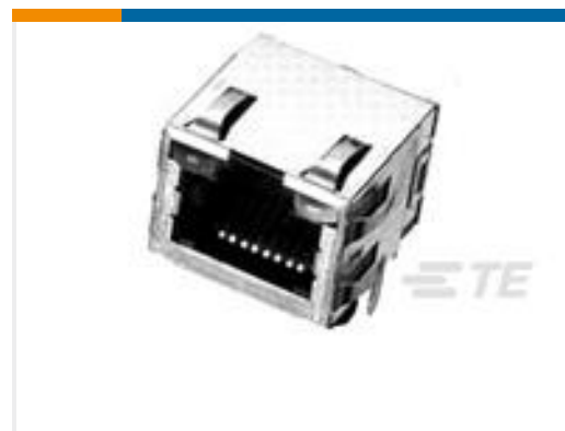
TE Part #1888566-2 IMJ,1X1,PNL GRD,LED(Y/G), SN