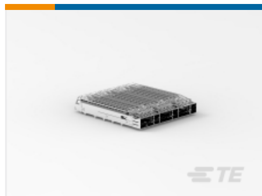
TE Part #4-2170740-1 QSFP28, 1X3, CAGE ASSY, SPRING, HS, LP