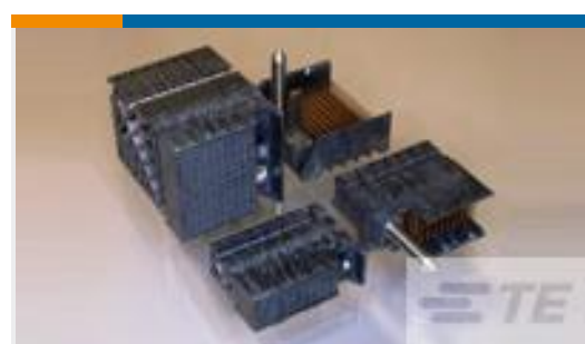
TE Part #2007882-3 IMP100S,H,V6P10C,UG,DEW46,5.5