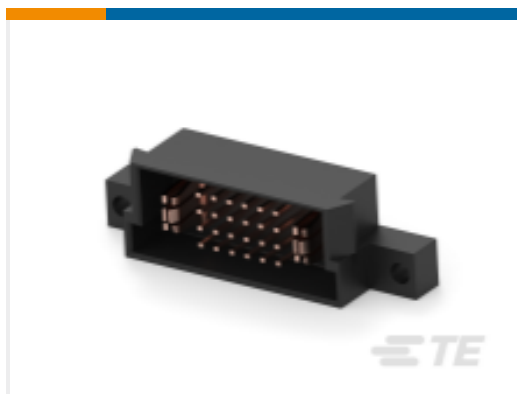
TE Part #1-6600383-9 MBXL VERT HDR 1P+24S+1P STR