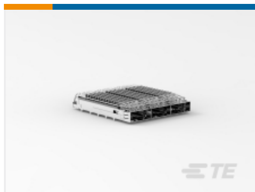
TE Part #4-2170740-2 QSFP28, 1X3, CAGE ASSY, SPRING, HS, LP