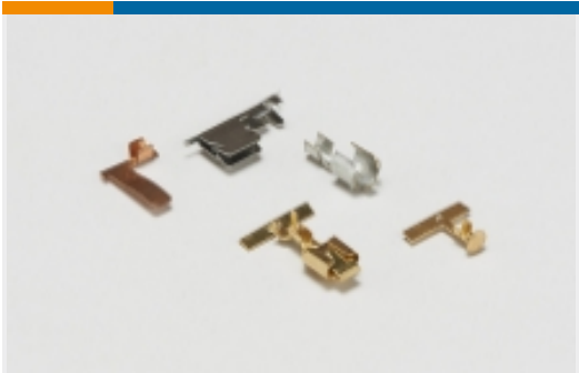
Special Purpose Terminals(2)