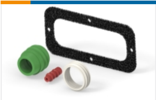
Connector Seals & Cavity Plugs(9)