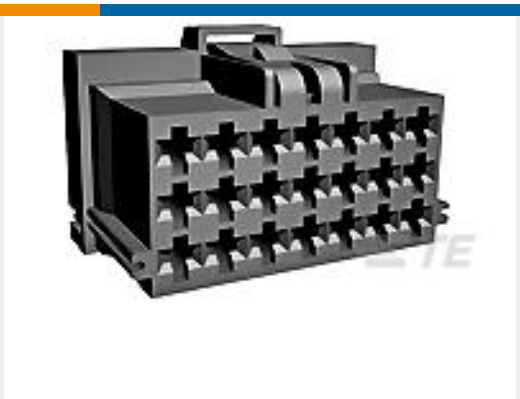
TE Part #4-968975-1 MCP2,8 GEH ASSY 21P