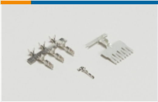
Busbars & Terminals(1)