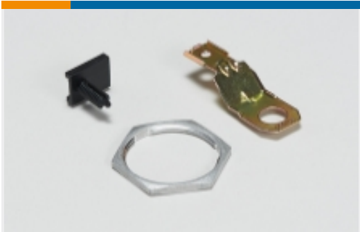
Other Automotive Connector Accessories(2)