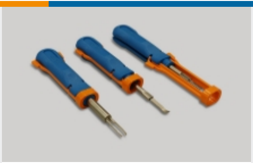
Insertion & Extraction Tools(8)