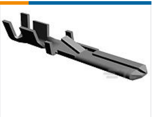
TE Part #928794-2 FF 110 TAB PTP CUZN30