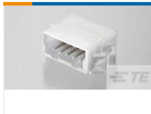
TE Part #1-292254-1 CT RELAY HDR ASSY 11P NAT