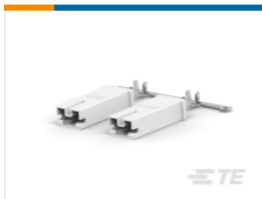
TE Part #2299282-3 POD-LOK 250 STR. AWG 14-12 TPBR GF