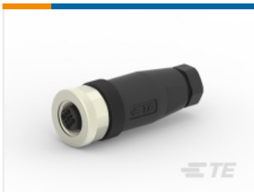
TE Part #T4110001031-000 M12,FEMALE,STRAIGHT,A CODE,3P, PG7,GOLD