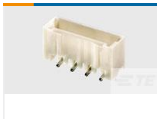
TE Part #292231-6 1.5 MINI CT SGL V SMT W/O BOSS