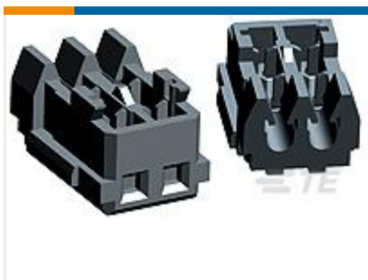
TE Part #353293-2 MINI CT MT REC.ASSY 2P GRAY