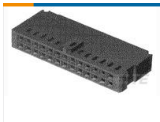
TE Part #102387-1 10 MODIV HSG COMP DR .100 POL