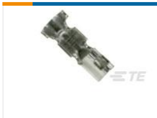
TE Part #179227-1 CRIMP TYPE II REC CONTACT