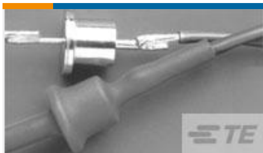
TE Part #5677644002 RNF-3000-6/2-2-SP