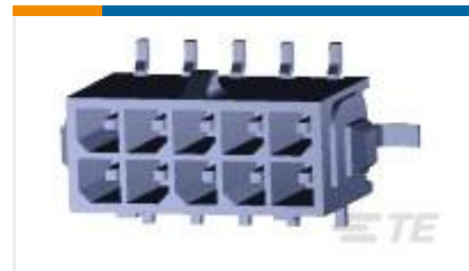
TE Part #4-794637-0 10P MICRO MNL ASSY,VRT,SMT LF