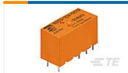
TE Part #1-1415899-3 RZ03-1A4-D005