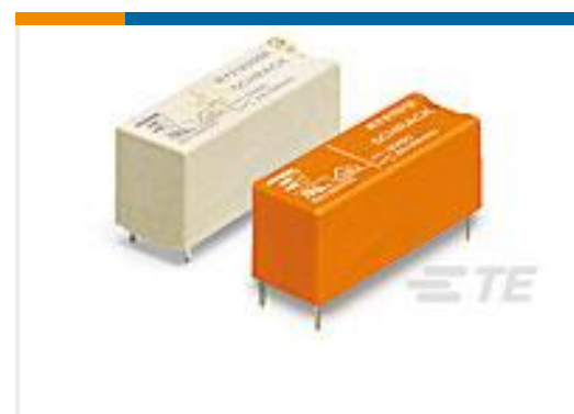
TE Part #6-1393224-0 RY213005