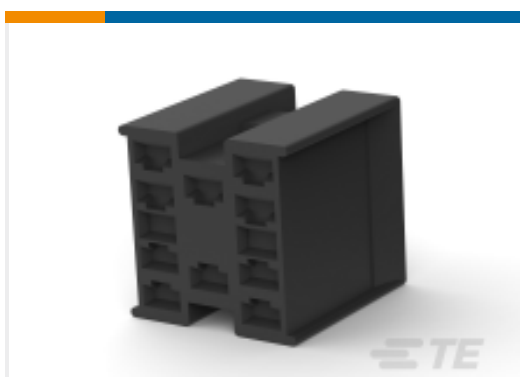
TE Part #964473-1 FF 110 TAB HSG 10P PBT BLACK