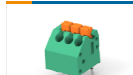
TE Part #1-2834011-3 3POS 3.5MM TOP ENTRY SCREWLESS CONN.