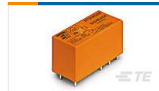
TE Part #5-1393238-7 RTD14F03