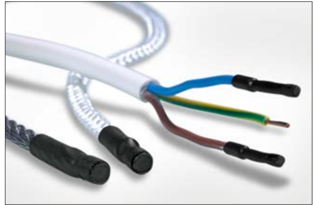
The appropriate end cap for every cable diameter, and cable types.