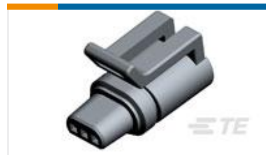
TE Part #1879980-1 MINI SUPERSEAL CONNECTOR