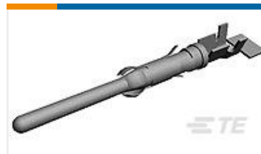
TE Part #926980-1 CI 2 STIFT