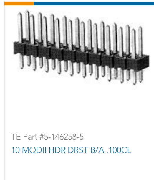
TE Part #5-146258-5 10 MODII HDR DRST B/A .100CL