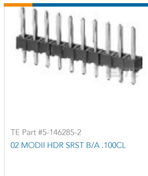
TE Part #5-146285-2 02 MODII HDR SRST B/A .100CL