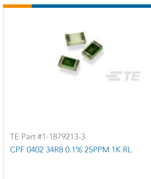
TE Part #1-1879213-3 CPF 0402 34R8 0.1% 25PPM 1K RL