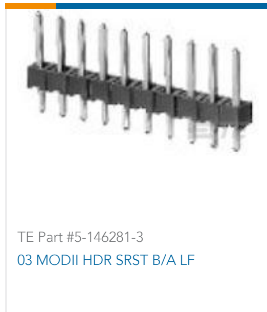
TE Part #5-146281-3 03 MODII HDR SRST B/A LF