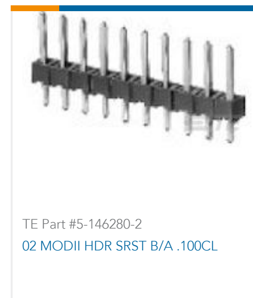
TE Part #5-146280-2 02 MODII HDR SRST B/A .100CL