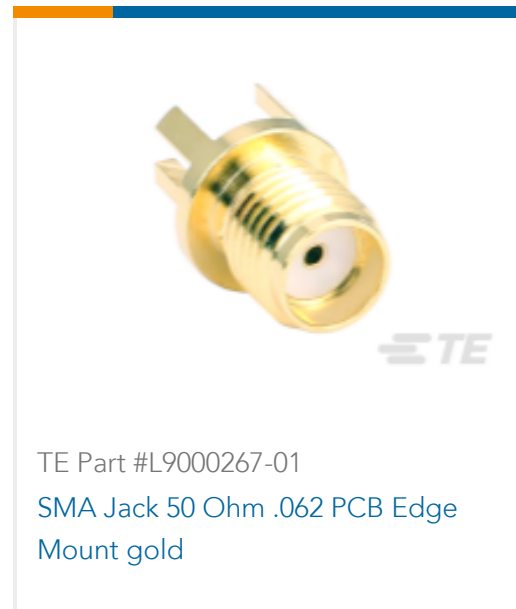
TE Part #L9000267-01 SMA Jack 50 Ohm .062 PCB Edge Mount gold