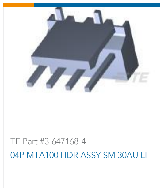
TE Part #3-647168-4 04P MTA100 HDR ASSY SM 30AU LF