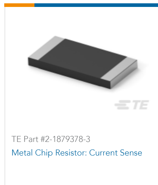
TE Part #2-1879378-3 Metal Chip Resistor: Current Sense