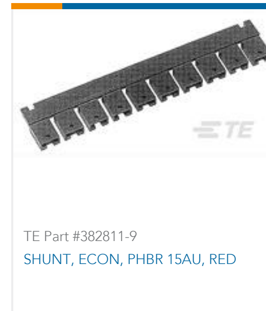
TE Part #382811-9 SHUNT, ECON, PHBR 15AU, RED