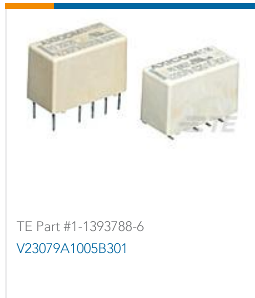
TE Part #1-1393788-6 V23079A1005B301