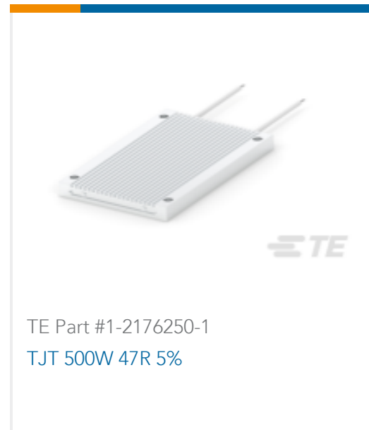
TE Part #1-2176250-1 TJT 500W 47R 5%