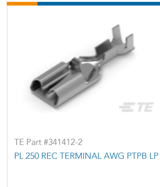
TE Part #341412-2 PL 250 REC TERMINAL AWG PTPB LP