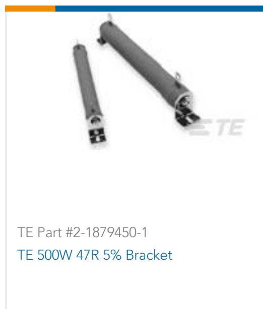
TE Part #2-1879450-1 TE 500W 47R 5% Bracket