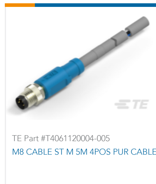
TE Part #T4061120004-005 M8 CABLE ST M 5M 4POS PUR CABLE