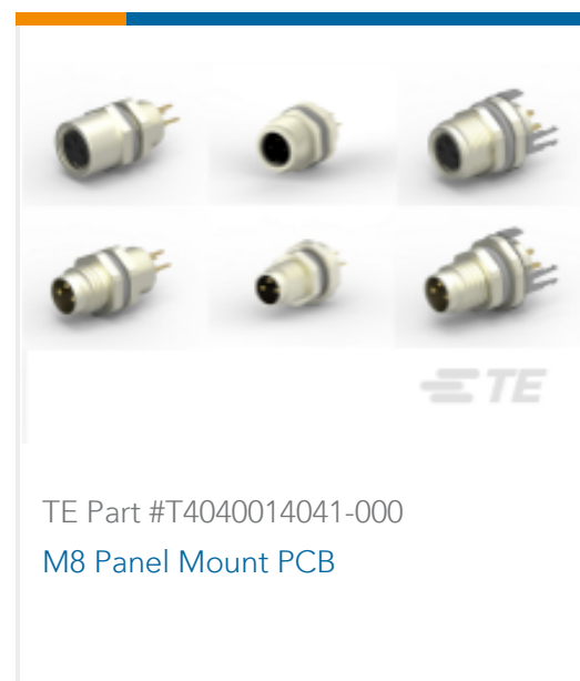
TE Part #T4040014041-000 M8 Panel Mount PCB