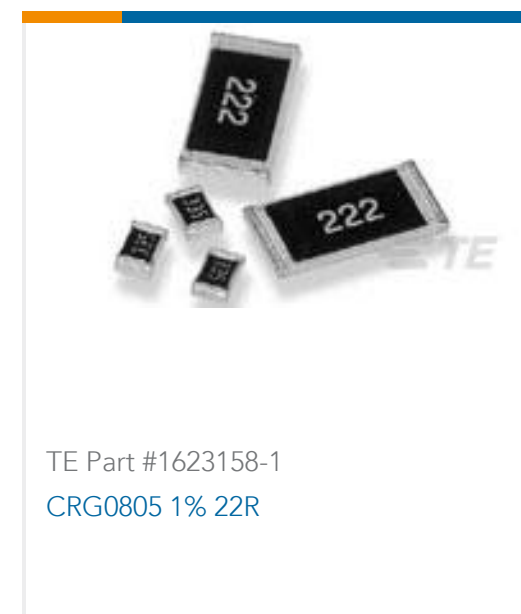
TE Part #1623158-1 CRG0805 1% 22R