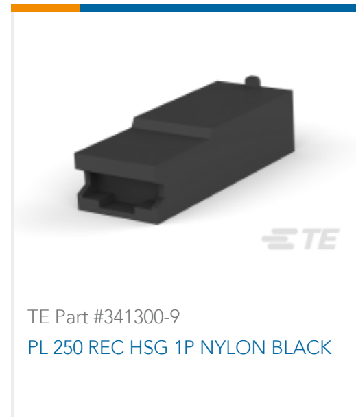
TE Part #341300-9 PL 250 REC HSG 1P NYLON BLACK